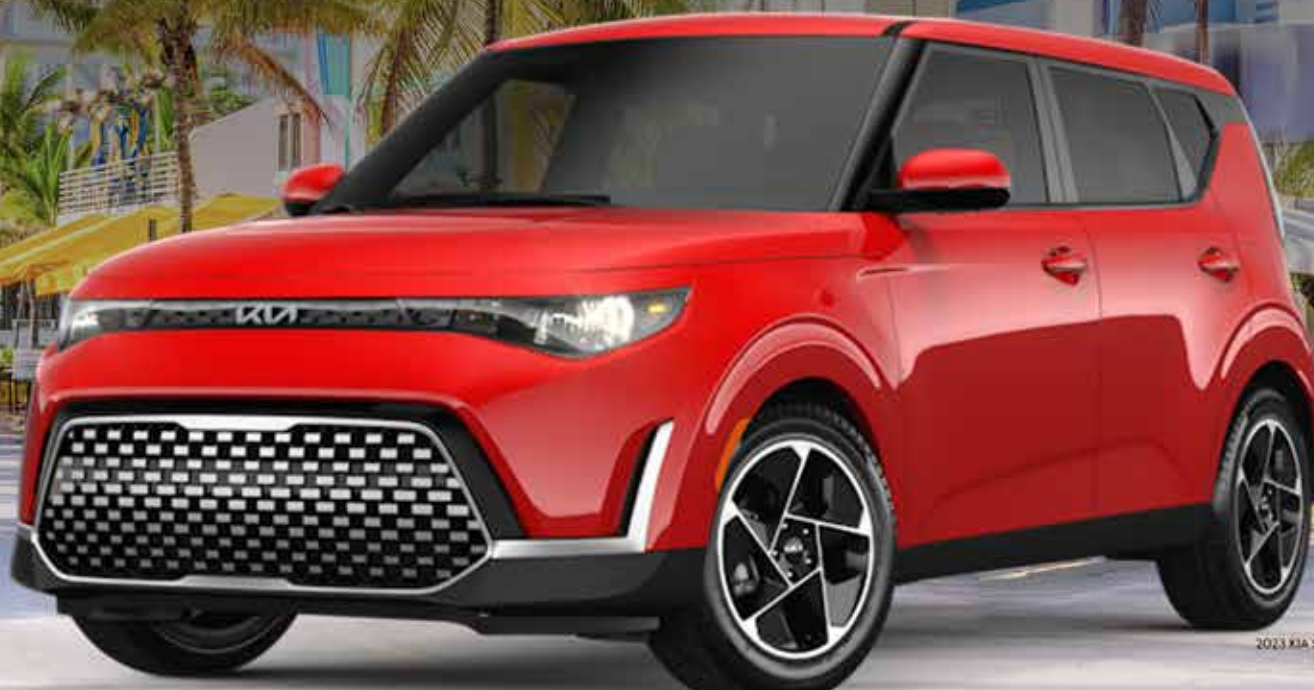
2023 KIA SOUL