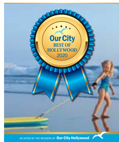
AS VOTED BY THE READERS OF Our City Hollywood