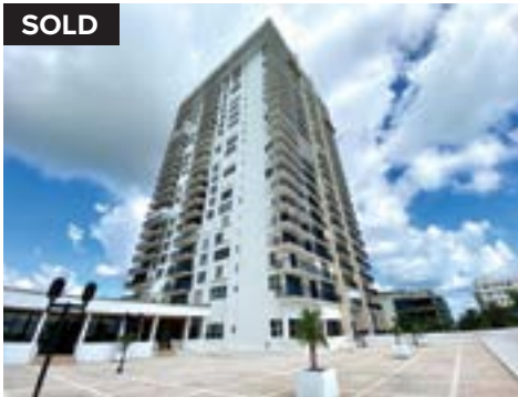
Just Sold: Hollywood 2201 South Ocean Drive #2102