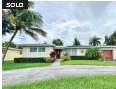
Just Sold: Hollywood 3232 Van Buren Street