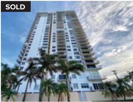
Just Sold: Hollywood 2101 South Ocean Drive #2305