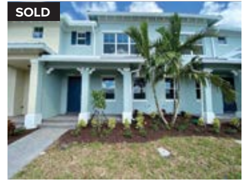
Just Sold: Hollywood 1070 Eucalyptus Drive #5