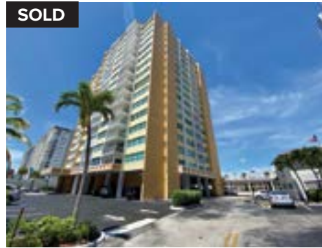
Just Sold: Hollywood 1410 South Ocean Drive #1508